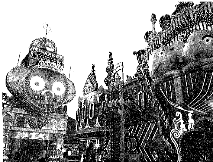
Figure 1 Phuket Fantasy Co., Ltd. (Public Company) 1 Source: Yuttapong Tonpradoo ( on 17th January 2023 )

4. The research establishes Phuket Fantasy Co., Ltd. as an exemplary model for the development of man-made tourist attractions. The attraction's commendable management approaches, strategies, and operational methodologies serve as a valuable benchmark for other analogous attractions aspiring to optimize their performance and competitiveness. The findings provide valuable insights into the requisite elements necessary for fostering the sustainable growth and advancement of man-made tourist attractions, which can be thoughtfully adapted and adopted across diverse contexts.