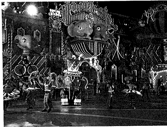
Figure 2 Performance of Phuket Fantasy Co., Ltd. (Public Company)