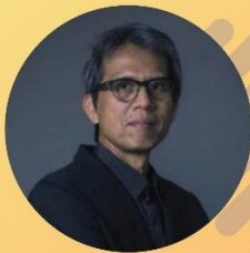
Emeritus Prof. Yanawit Kunchaethong

“Real Material, Implications of Interpretation, Site Context affects the creation of art and design in Bio Curriculum Green Economy”