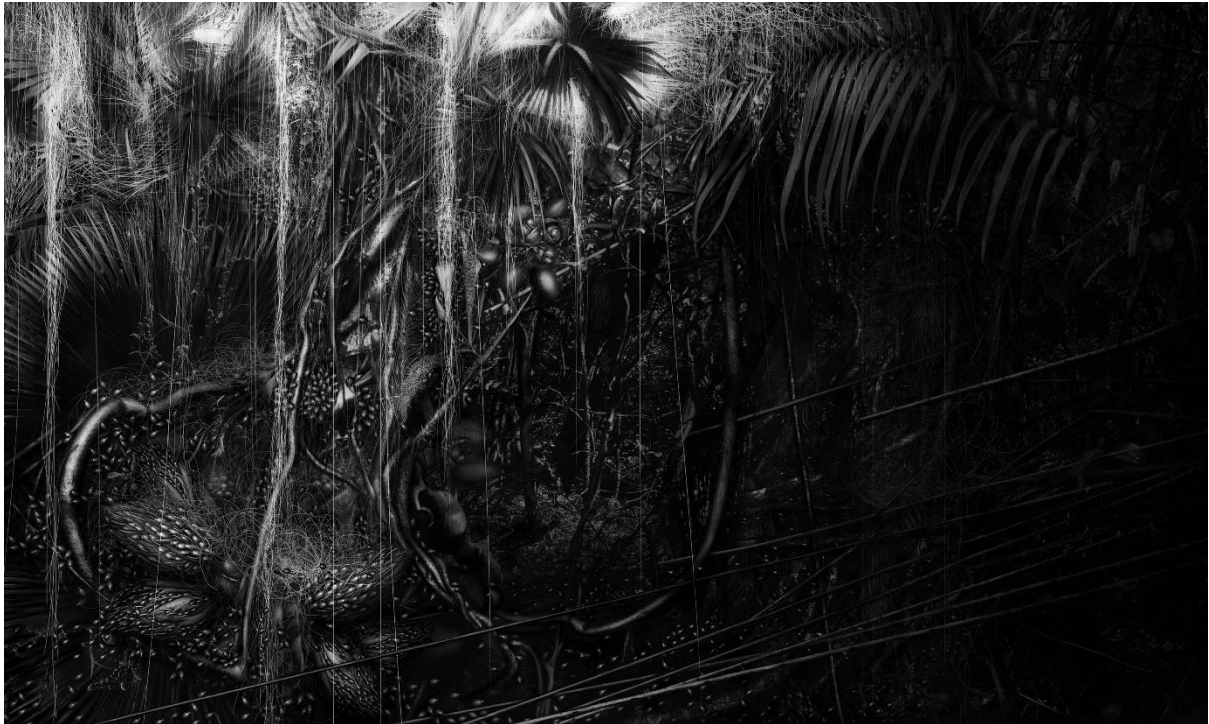
ผลงานสร้างสรรค์ "The Light of Life Power no.5"