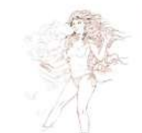
Figure 2: Make a new layer and cut lines to define the shape's links. To analyze the overall composition of the painting, both female and tiger figures were used.