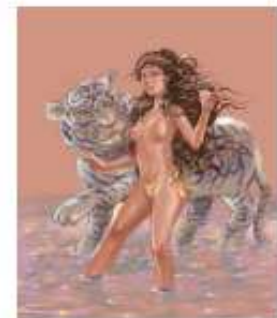
Figure 3: Use flat colors to outline the forms' edges, taking into account color atmosphere.