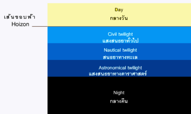
Figure 1: Diagram of dusk and dawn