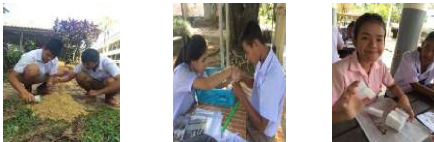
Figure 2: Student's learning activities

4. Satisfaction of students on learning about surface area and volume for students of Mathayomsuksa III by organizing learning activities with STEM Education, the learning activities were conducted according to the level of education.