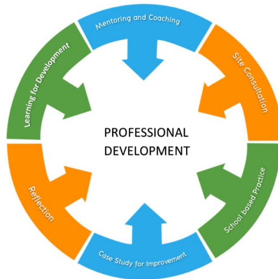
Figure 1 Professional Development Framework

The STPI program consisted of inquiry activities, teaching strategies (Explicit-Reflective and Content based approach) (See Figure 2 )